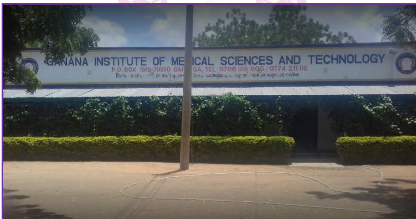
Front view of college

We at GIMSAT recognize this knowledge and skills gap and it is harmful to the society. It constrains the community's social economic advancement and empowerment. In this regard, our intent is to specifically address this knowledge and skills gap in the region and thus bring the youth at par with those of other regions in terms of employability and academic pursuits.