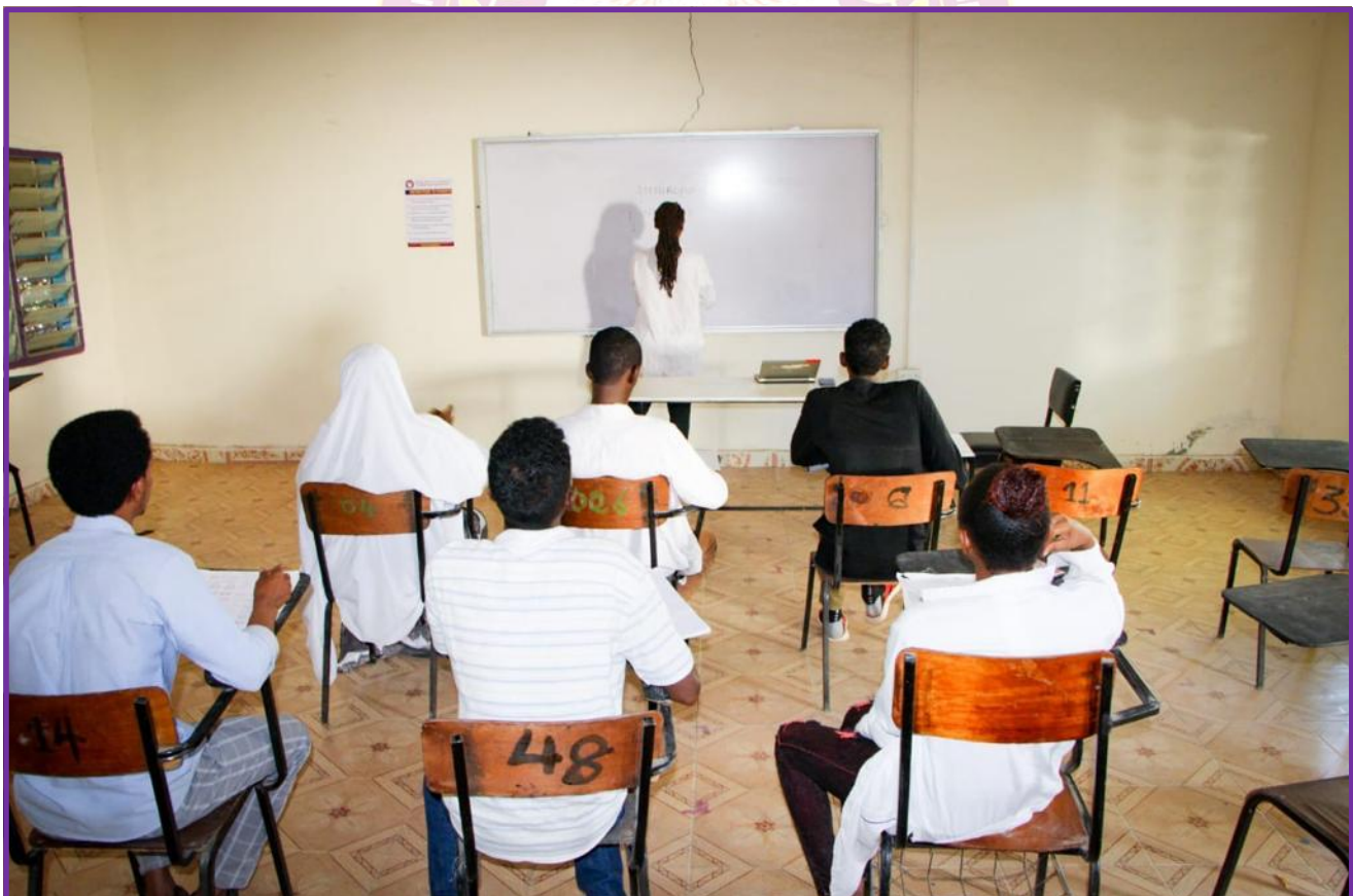
Learning in progress