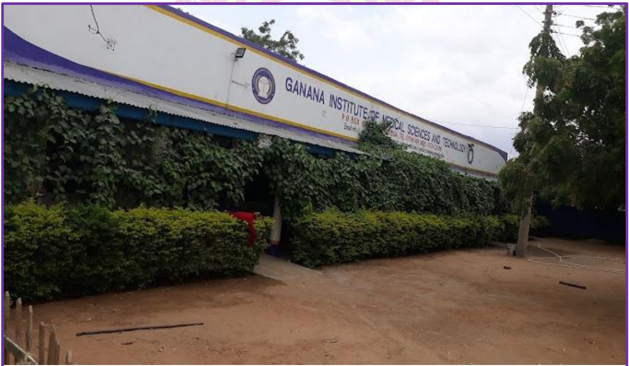
Parking area / Relaxing area